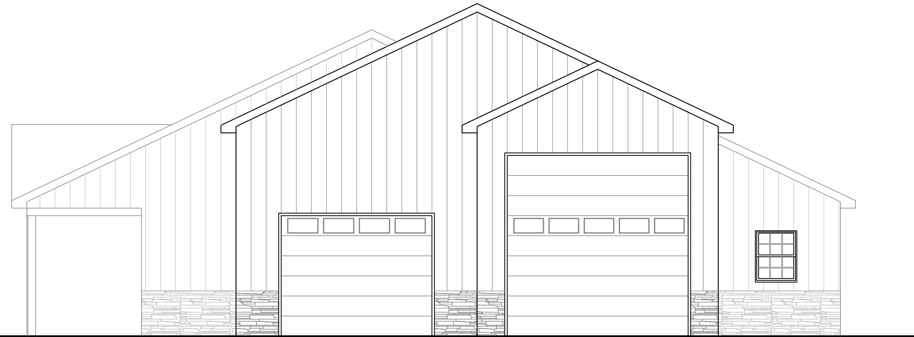
3 RIGHT SIDE ELEVATION 1/4" = 1'-0"