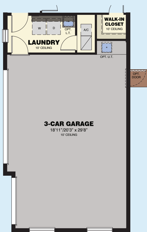
AVAILABLE 3-CAR GARAGE VARIATION