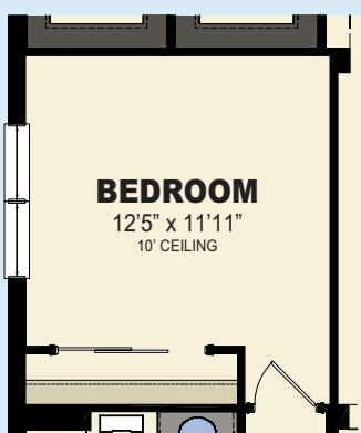
AVAILABLE BEDROOM VARIATION