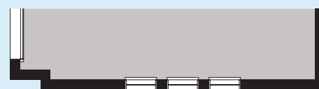
ELEVATION "C" VARIATION