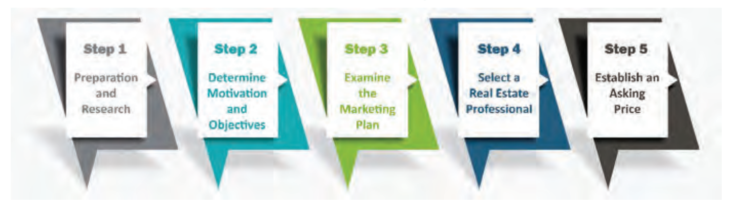
Step 1 – Preparation includes examining the home through critical buyers' eyes to determine what things must be done to the house to maximize the purchase appeal. These can include decluttering the home, removing furniture and belongings that make rooms or closets appear small. Determining what needs painting or what fixtures need replacing. Does the landscaping need attention? Is the drive-up appeal what it should be?

Research includes knowing your numbers and your neighborhood. What homes are on the market that the subject property will be competing with in price and how it compares to them in condition, location, and terms. It is important to know average market time, days on the market, days under contract, sales price to list price ratio and whether appraisals are meeting the sales prices.